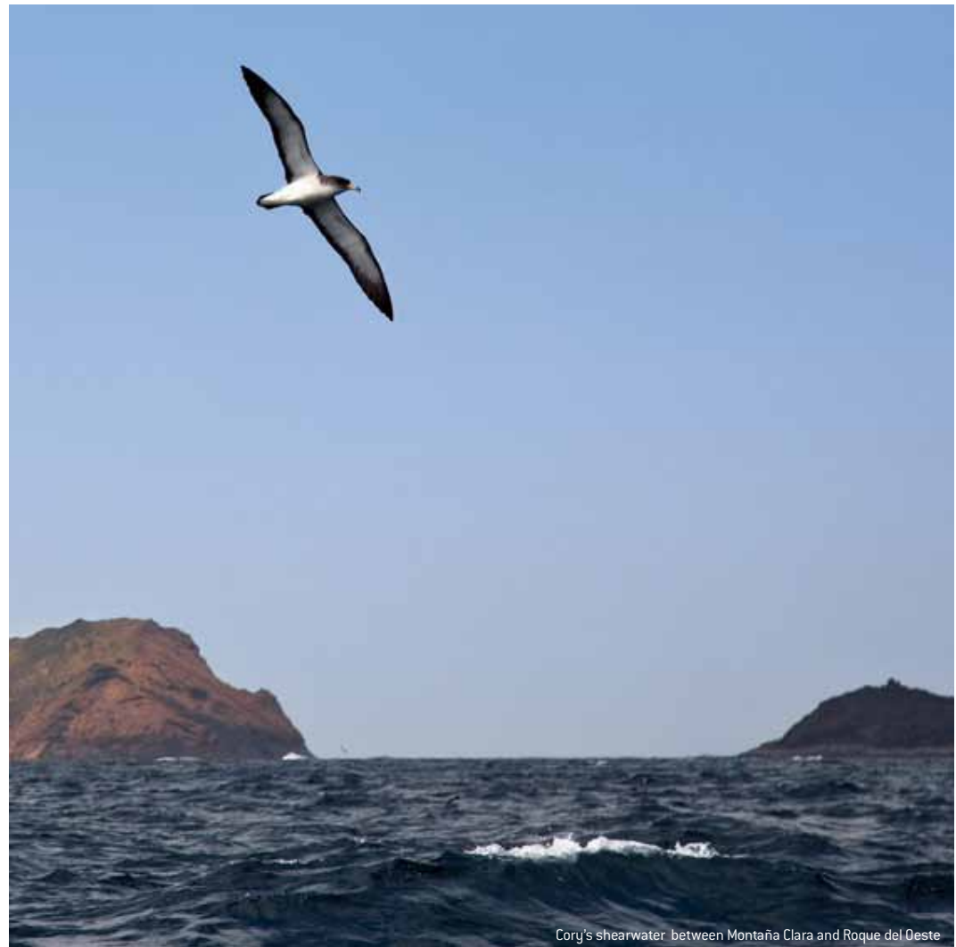
Cory's shearwater between Montaña Clara and Roque del Oeste