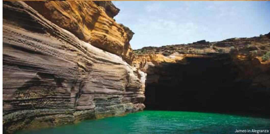
Jameo in Alegranza