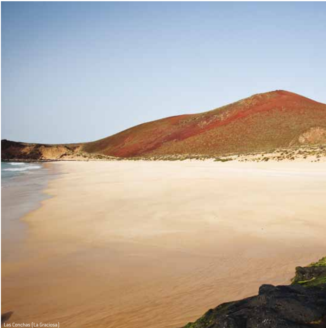
Las Conchas (La Graciosa)