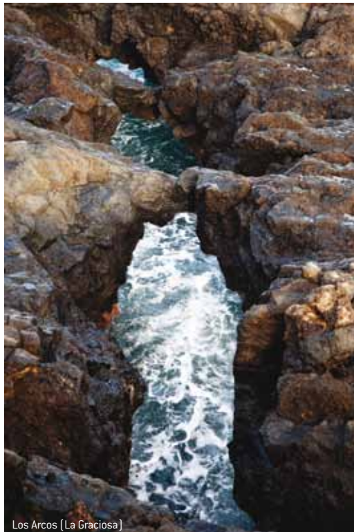
Los Arcos (La Graciosa)

of marine birds, and that is another reason why the area has been declared a Special Protected Bird Species Area. The largest European population of Cory's shearwater is found here, in addition to a number of extremely rare and threatened species, such as white-faced storm-petrel as well as common kestrels, owls, Eleonora's falcons and sea eagles. Undoubtedly, it is an ideal breeding ground, under the watchful eye of man.