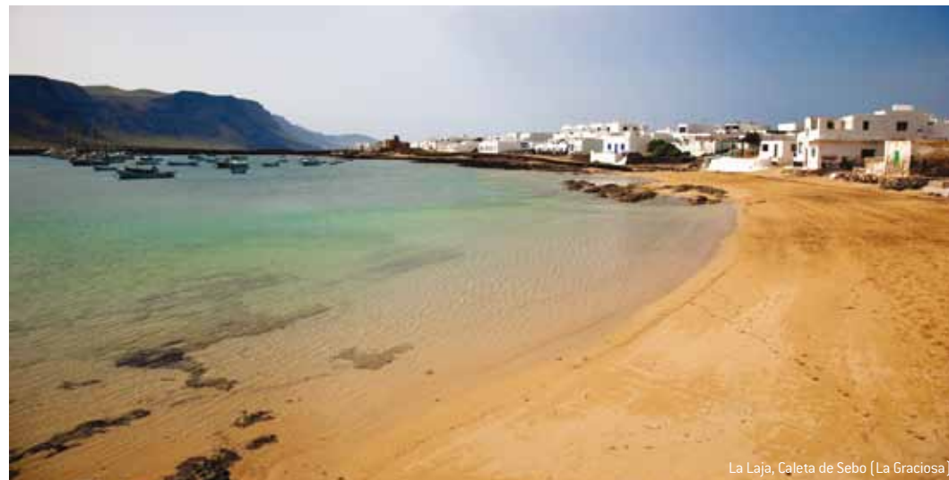
La Laja, Caleta de Sebo (La Graciosa)