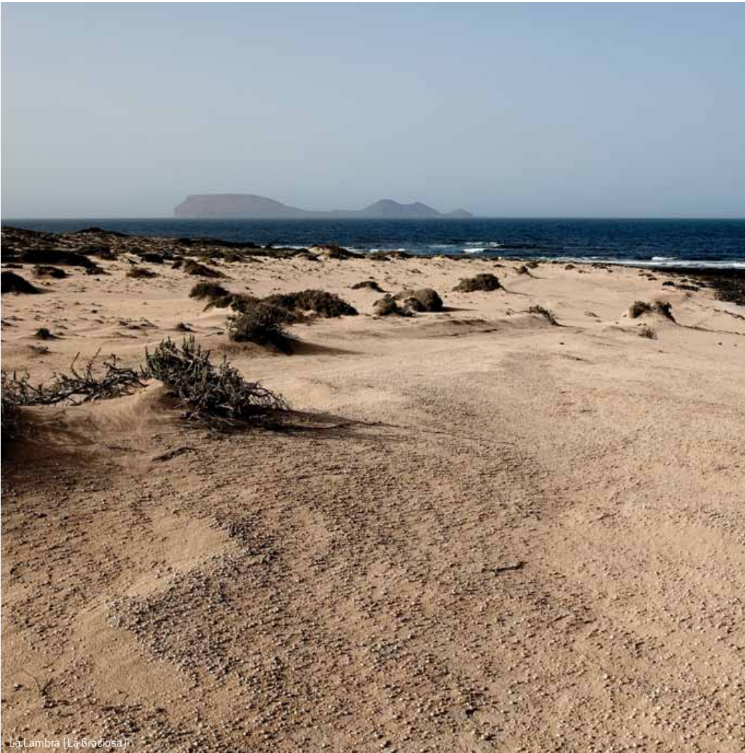
La Lambra (La Graciosa)